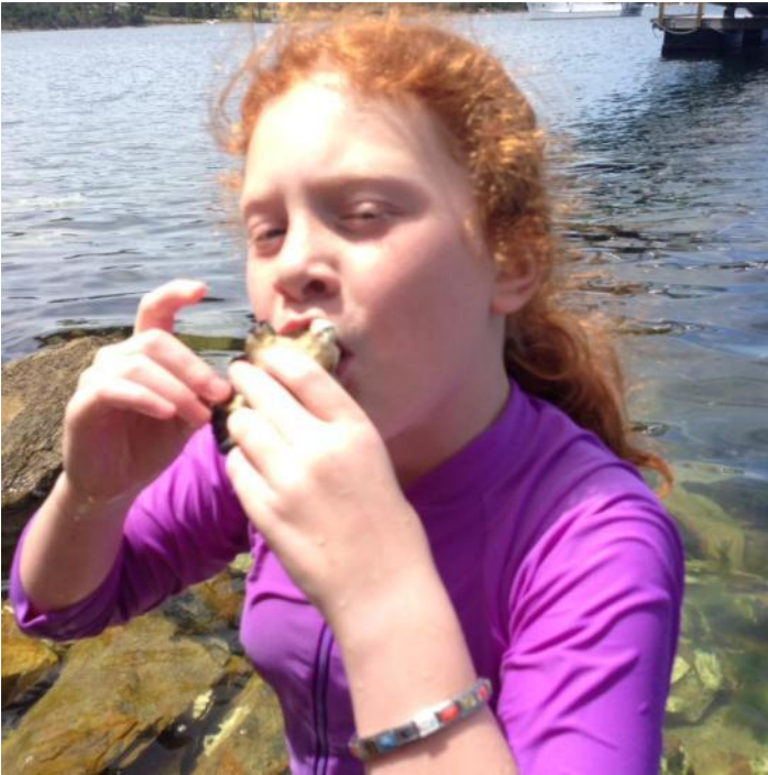
(Gran Shucking oysters at the van park)

oyster picking off the rocks - yet another new experience.