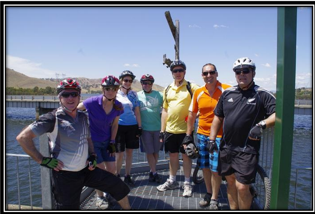
A group in January from Nunawading taking advantage of the extensive bike trails via Lake Eildon.